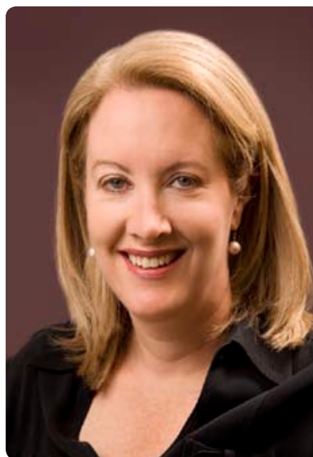
Elizabeth Broderick Sex Discrimination Commissioner and Commissioner responsible for Age Discrimination

This is what the paper seeks to do – it names and examines this form of discrimination. The paper explains what age discrimination and ageism are and what they can look like in our workplaces. It explains the rights we need to protect us from unlawful age discrimination and the effects of ageism and outlines the often devastating impacts this form of discrimination can have on the lives of individuals, our communities and our nation as a whole.