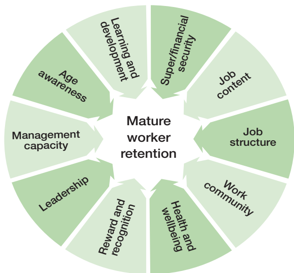
Figure 1 Mature Worker Retention Model (BWA 2007)

Reproduced with permission of Business, Work and Ageing, Swinburne University.