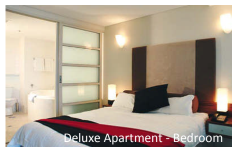
Deluxe Apartment - Bedroom

Room Features: full kitchen & laundry facilities, Mini bar, air-conditioning, Colour TV, in house movies & free cable TV, Broadband internet access and an in room safe