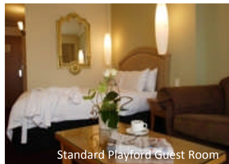
Standard Playford Guest Room