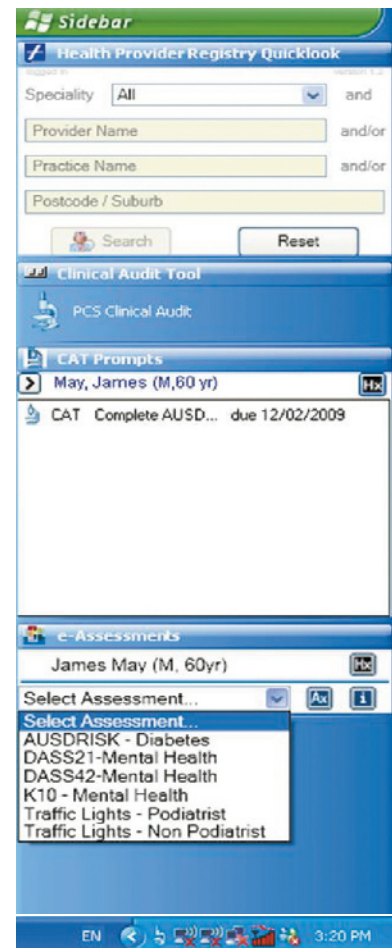
Primary Care Sidebar